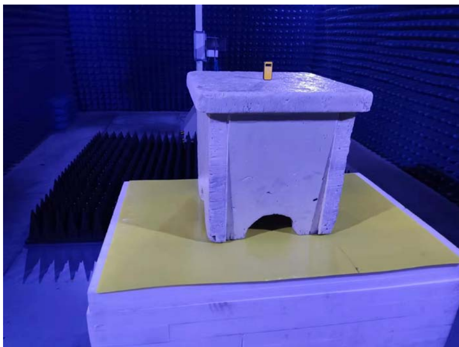
Photo of Radiated Emission Measurement Above 1GHz