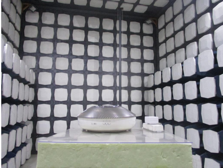
Back View (Above 1GHz)