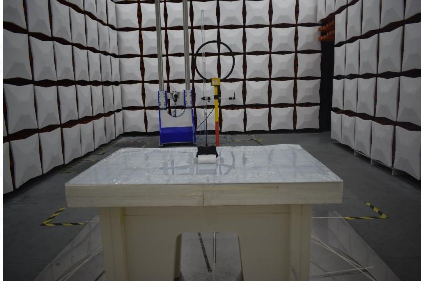
TX below 30MHz