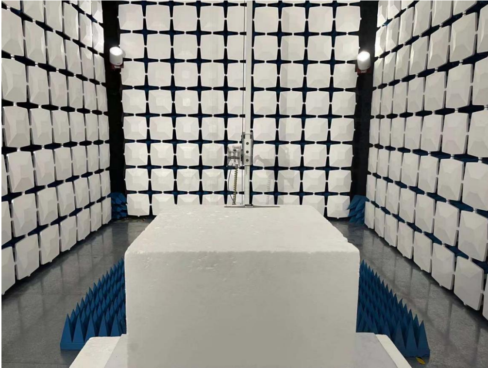
Blow 1GHz for radiated emission test setup