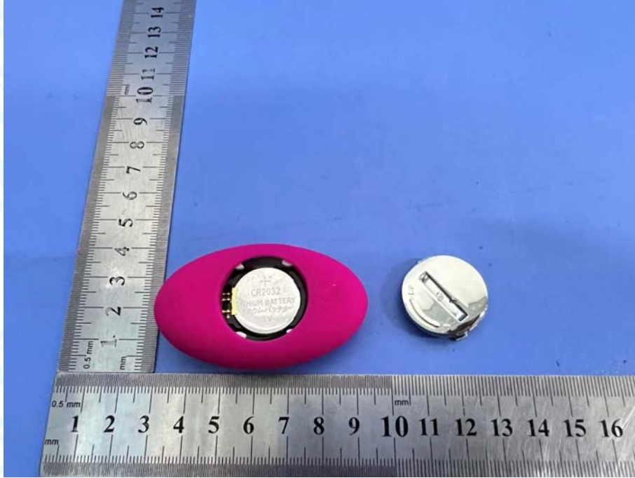
Photo 4 Internal of PCB