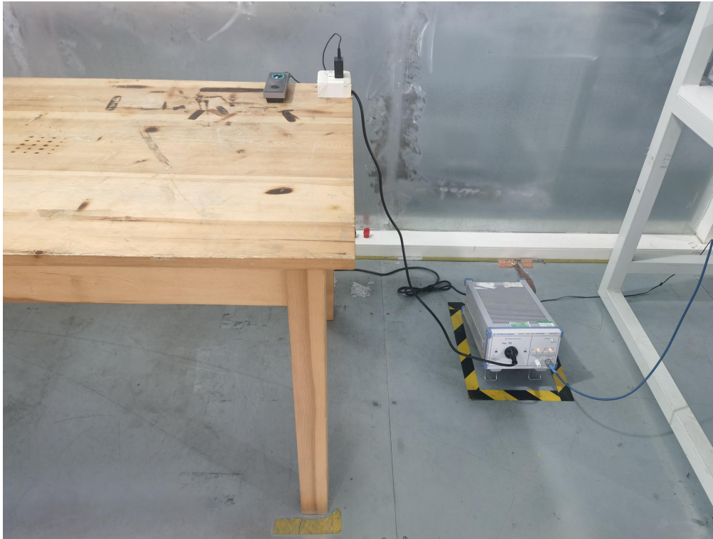
AC Conducted Emission of charge from power adapter mode