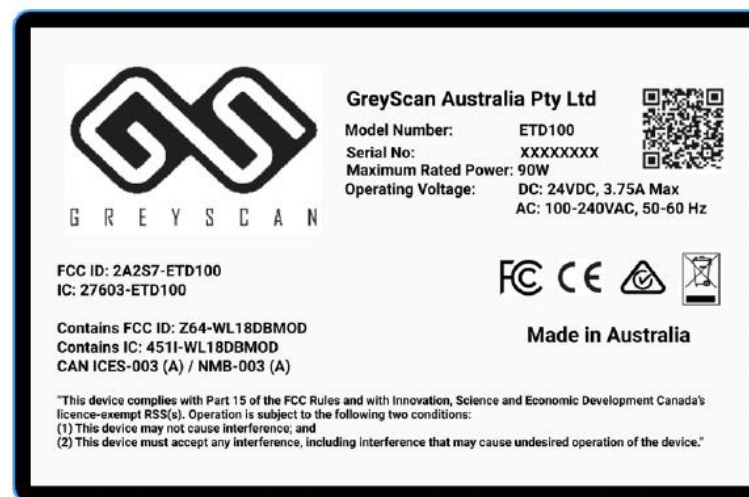
Figure 62: Device Label