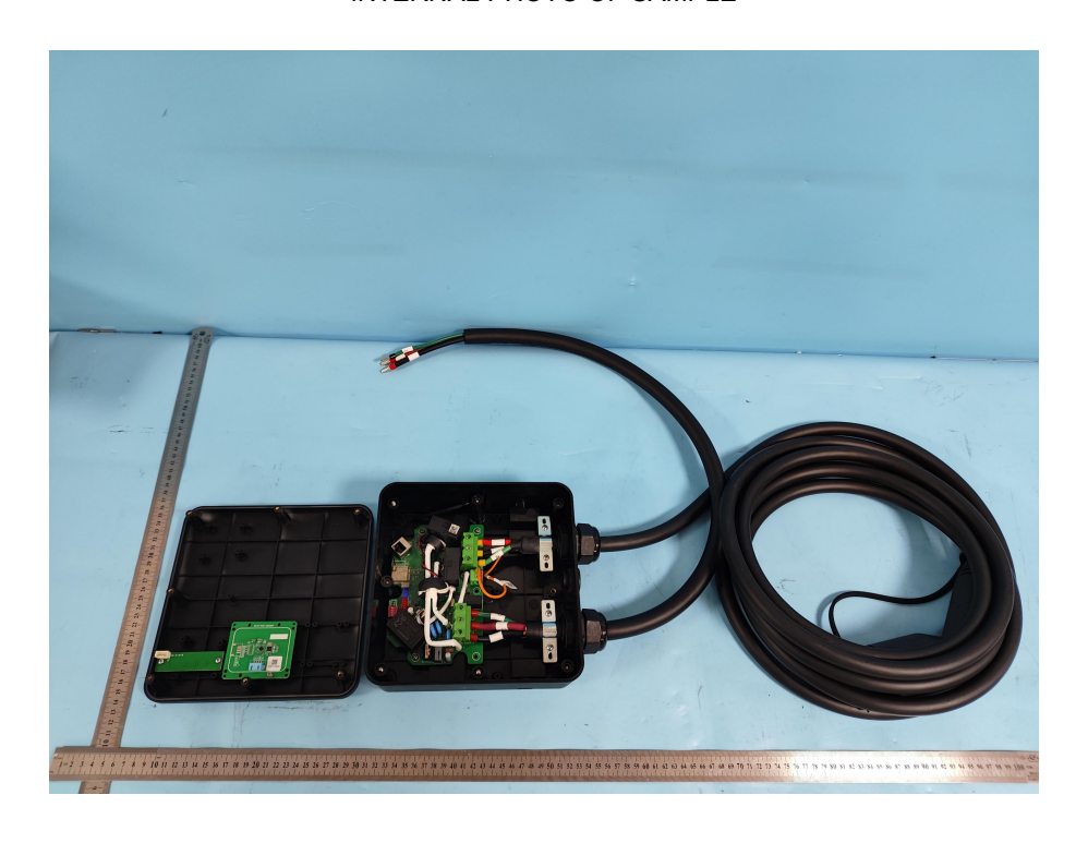
INTERNAL PHOTO OF SAMPLE