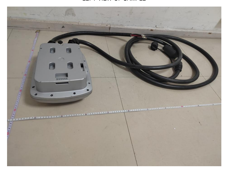
RIGHT VIEW OF SAMPLE