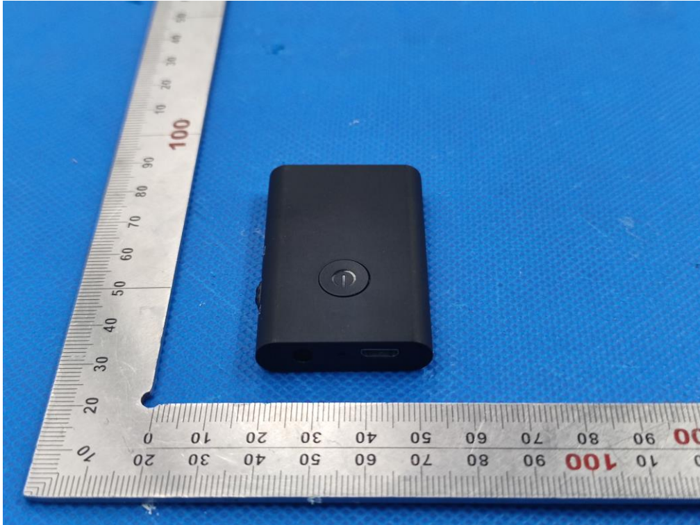
BACK VIEW OF EUT