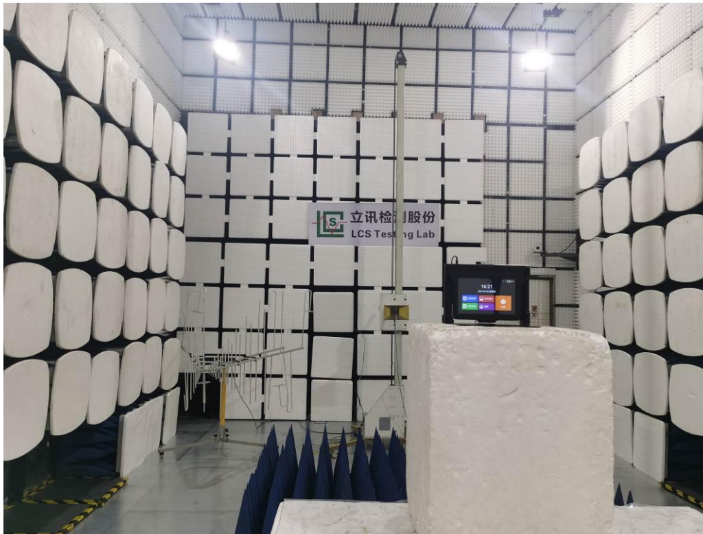
Fig. 2 (Above 1GHz)