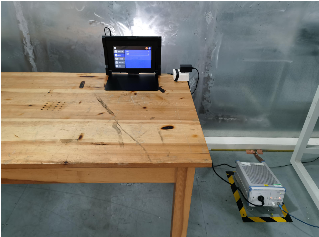
AC Conducted Emission of charge from power adapter mode