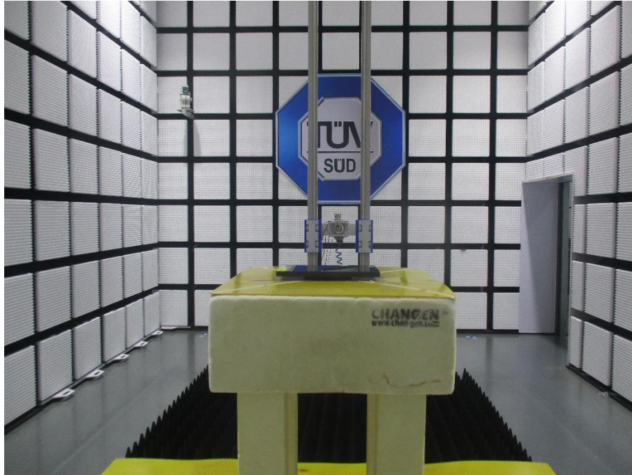
18G-40GHz RSE Setup