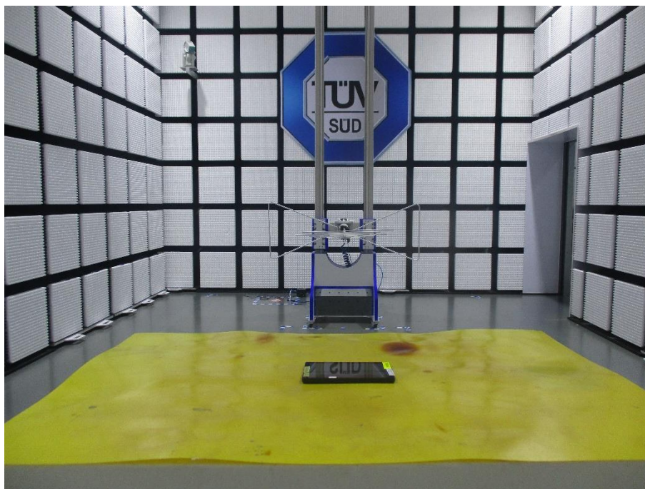
30M-1000MHz RSE Setup