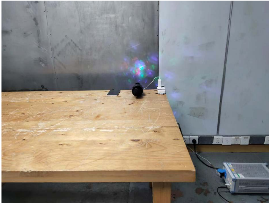
Photo of Power Line Conducted Emission Measurement