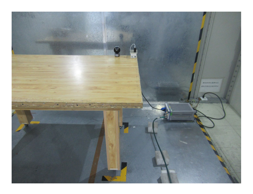
Conducted Emissions- Left View