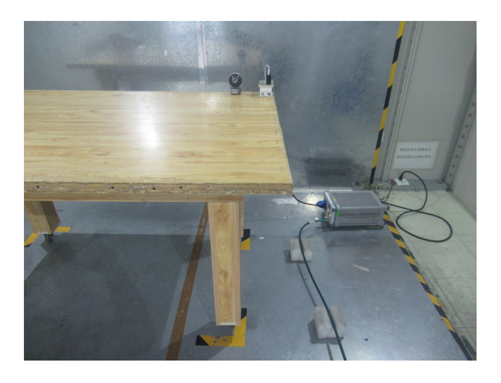
Conducted Emissions- Left View