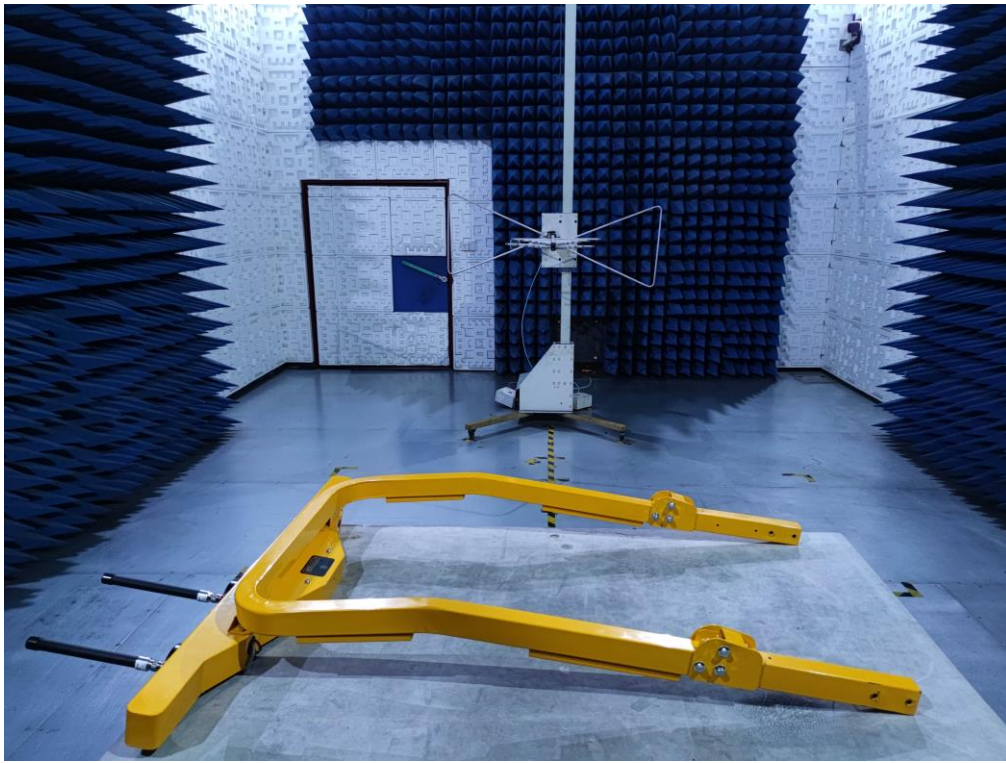
RADIATED EMISSION TEST SETUP ABOVE 1GHz