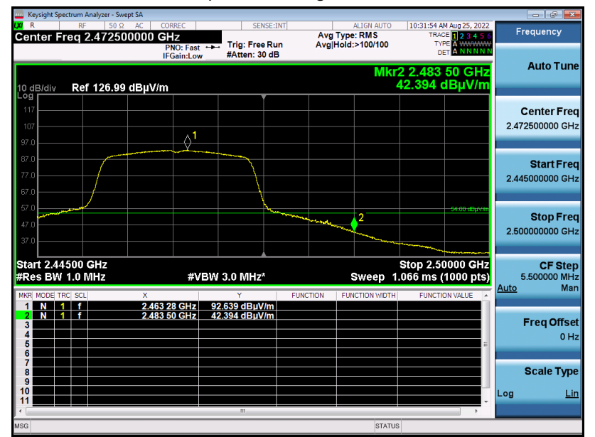
Test Graph for Average Measurement