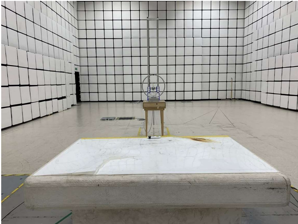
9 kHz to 30 MHz