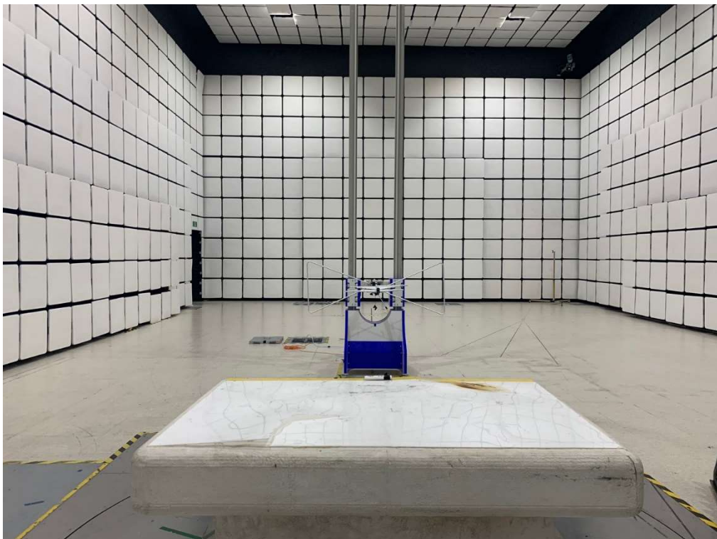
30 MHz to 1 GHz