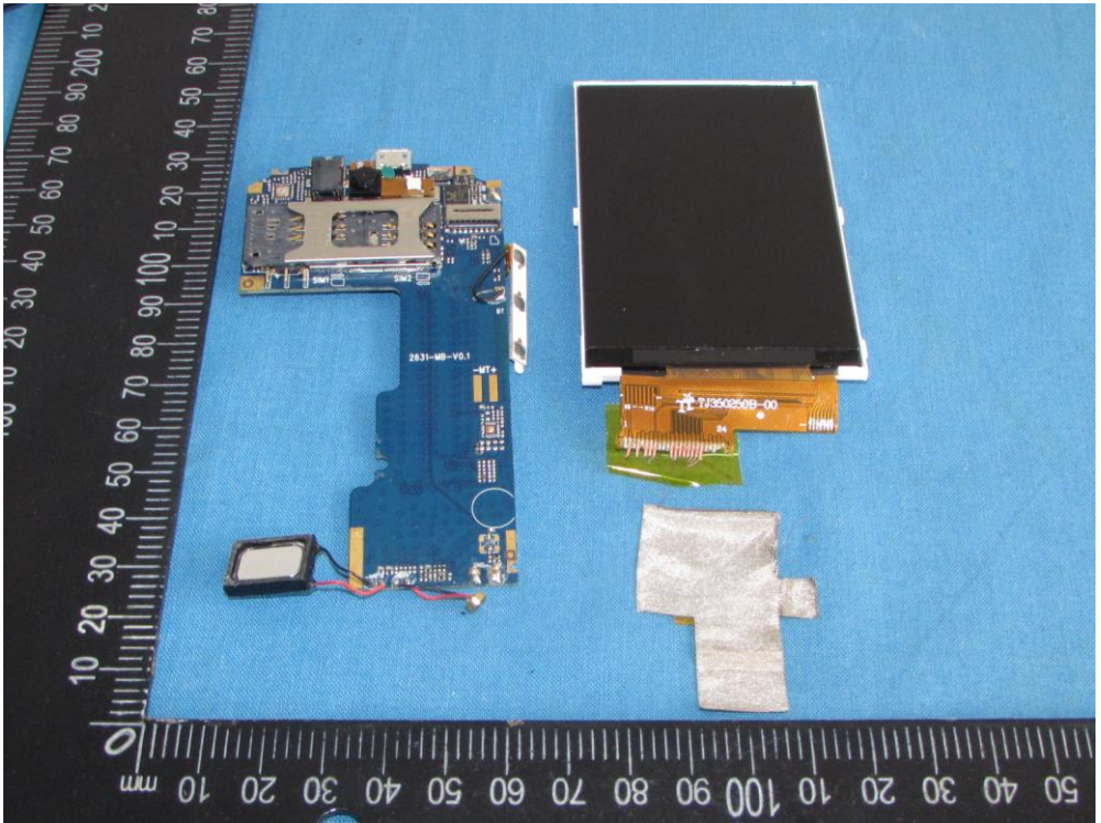
Fig.5 Miller. eo eo to 30 50 10 mm