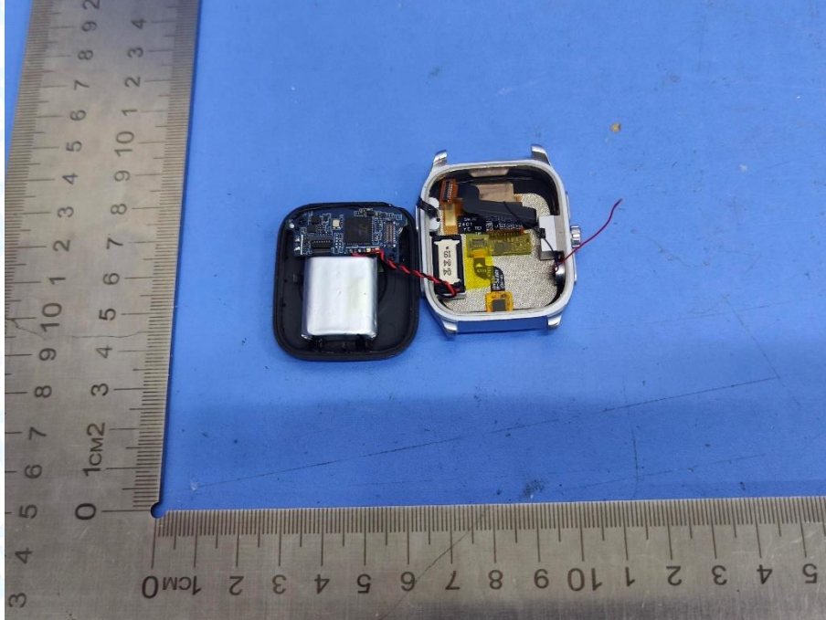
Photo 8 Appearance of PCB