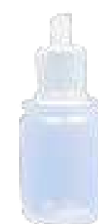
WATER BOTTLE x1