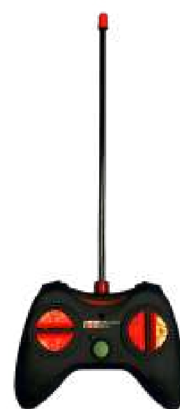
HANDLE REMOTE x1