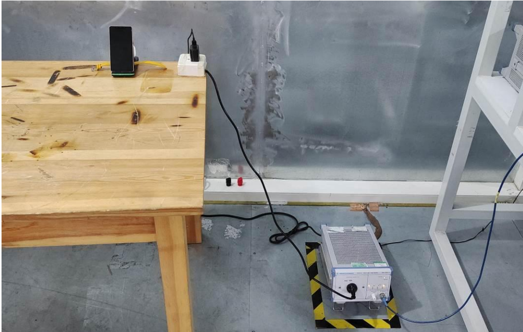
Conducted Emission-AC adapter charge mode