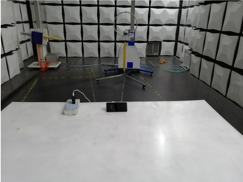
Conduction emission testing device