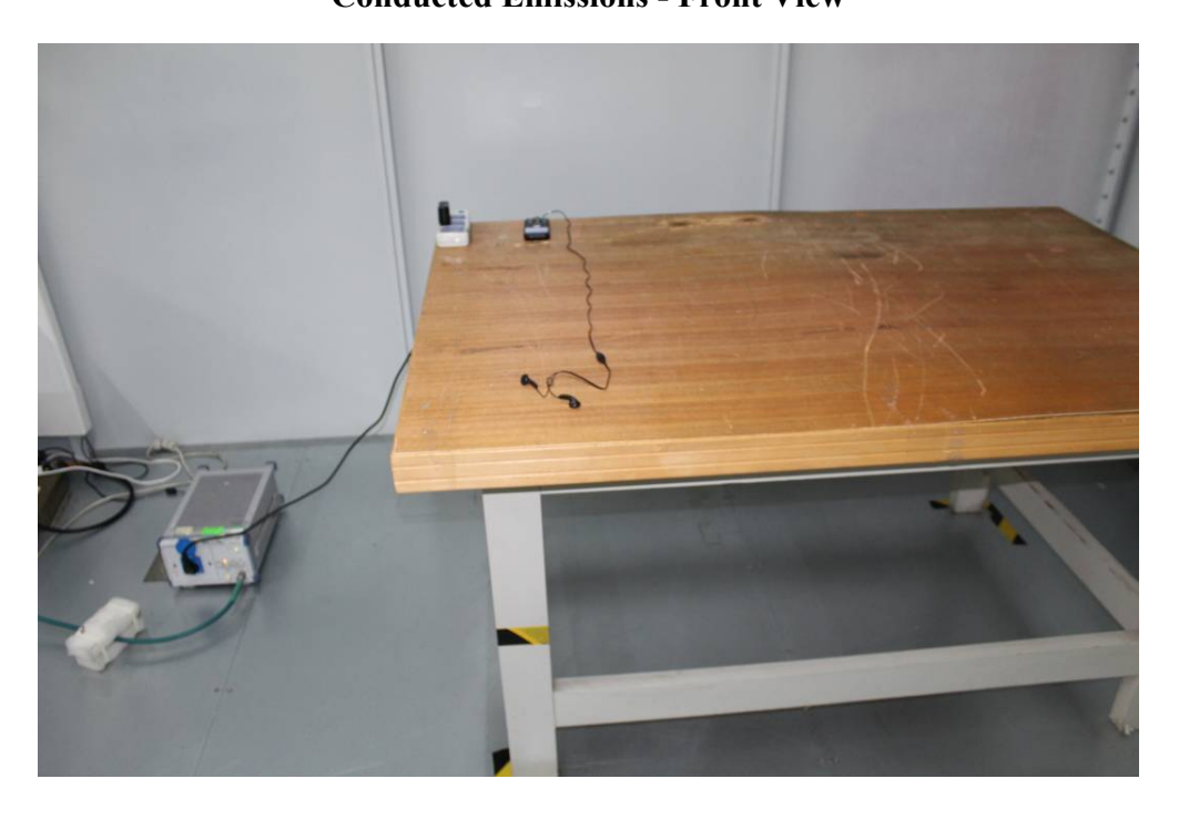
Page 2 of 4