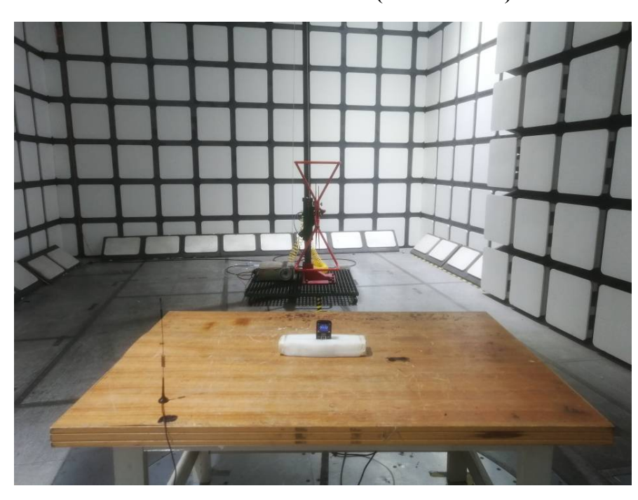
Page 3 of 4