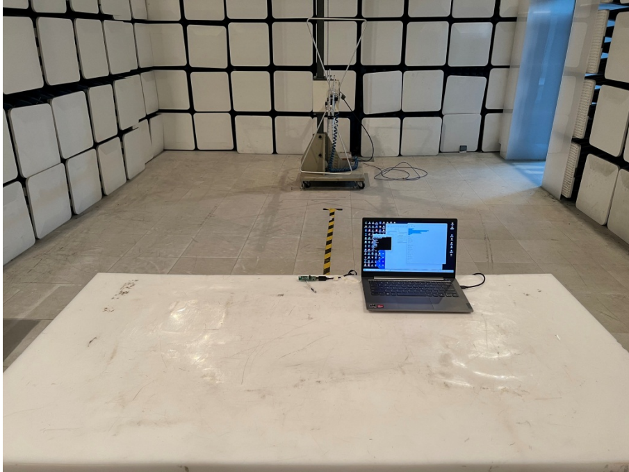
30MHz - 1GHz