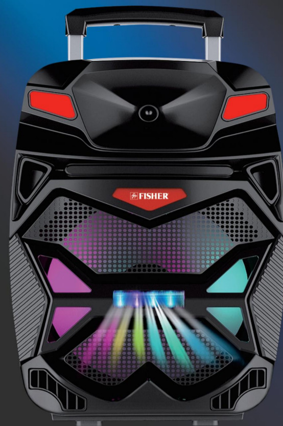
15" PORTABLE DJ SPEAKER