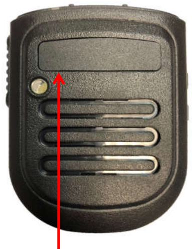
Black Front Label

Model: SM7-BT Wireless Speaker Mic. 7, Heavy Duty, Rechargeable battery Powered, IP55, 3.5mm earpiece port FCC ID: 2A2BD-SM7-BT