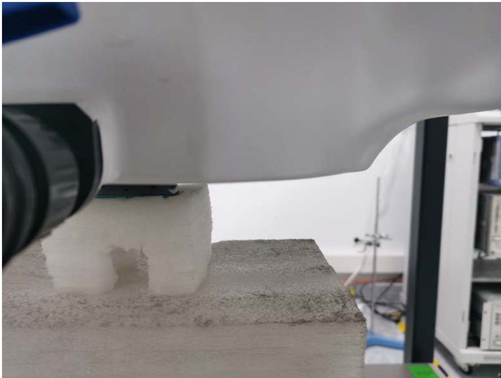
Wrist Worn –Back (0 mm)