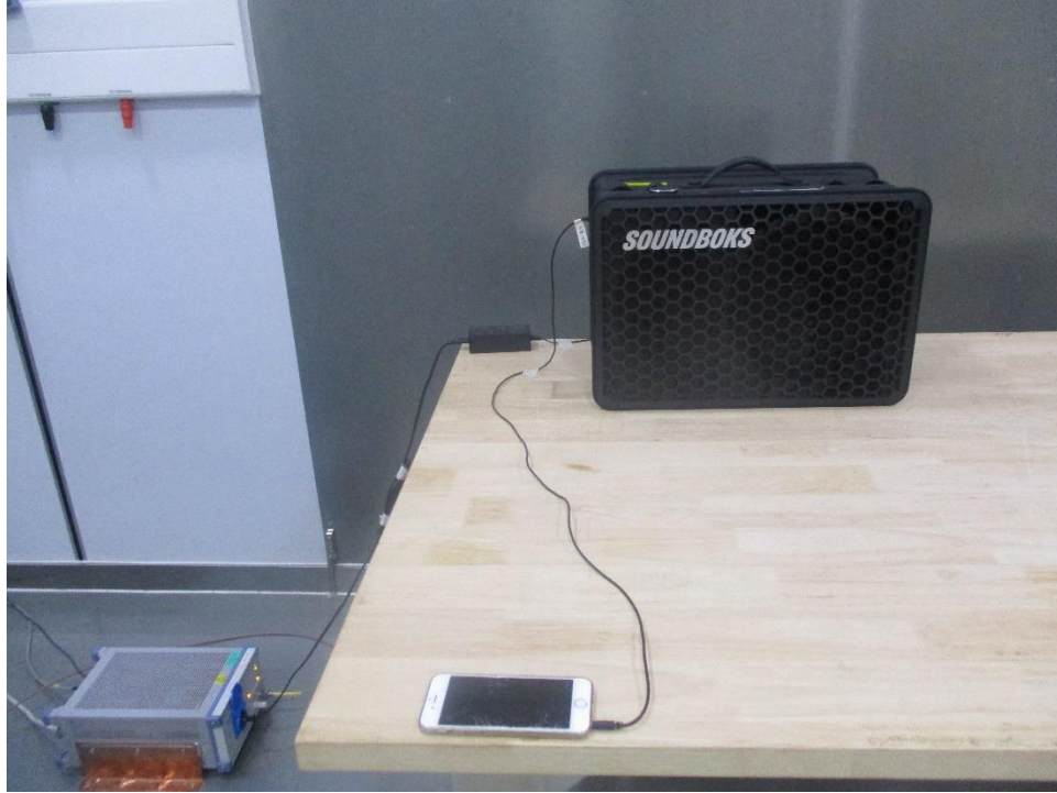
Conducted Disturbance Emissions on AC mains