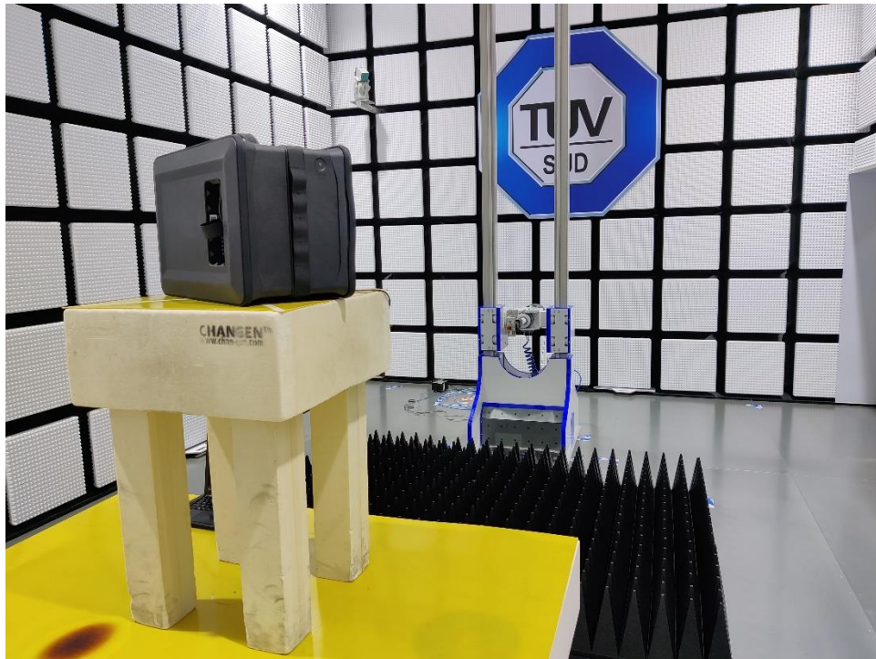
Radiated Spurious emission Above 18 GHz