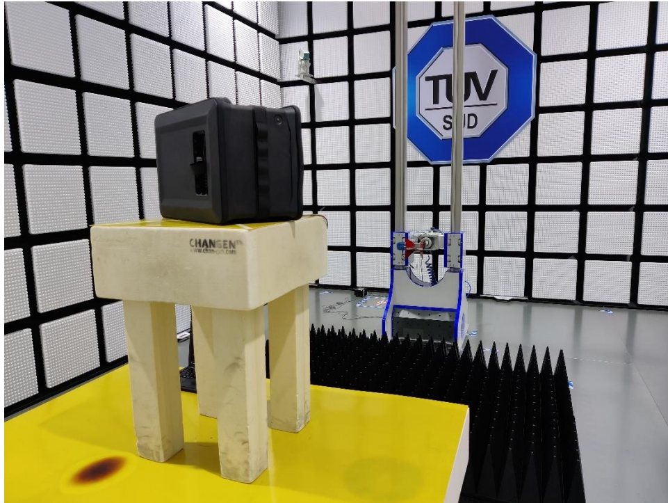
Radiated Spurious emission 1GHz - 18 GHz