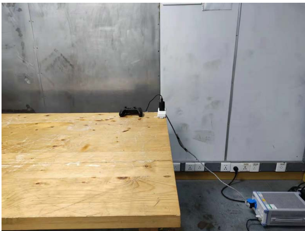
Photo of Radiated Emission Measurement Below 1GHz