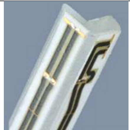
Photo of E-field Probe