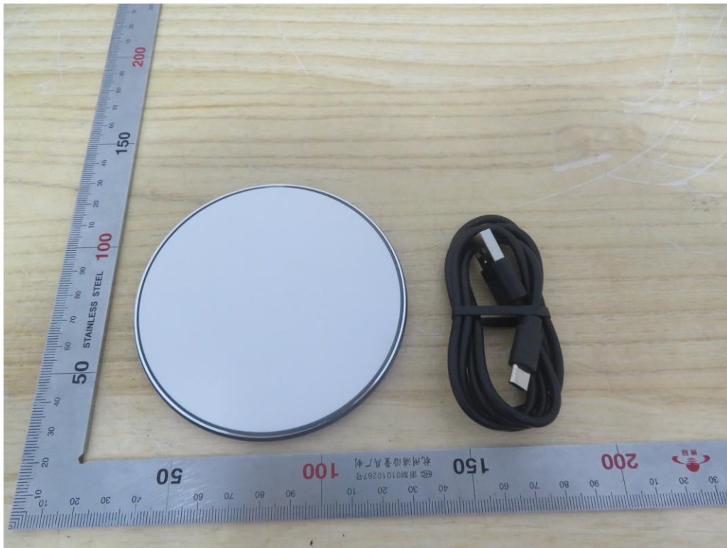
View of EUT-2