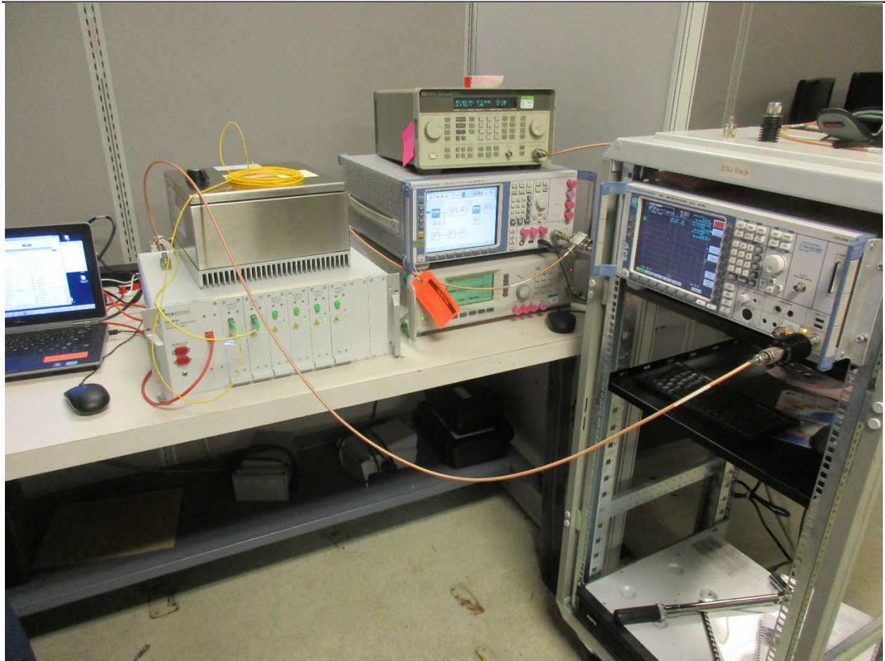
Conducted Test Setup