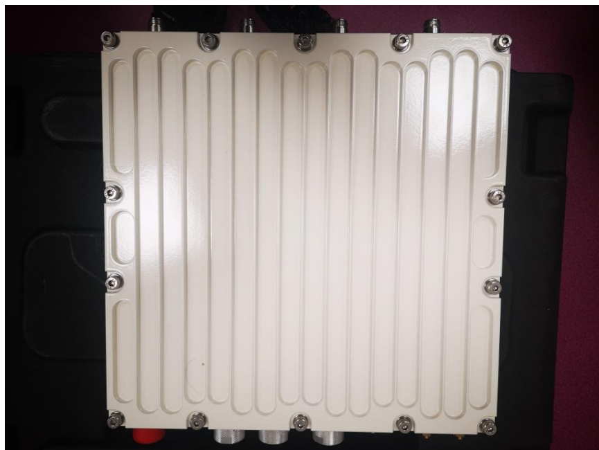
FIGURE 2 RRH B48 – BACK SIDE