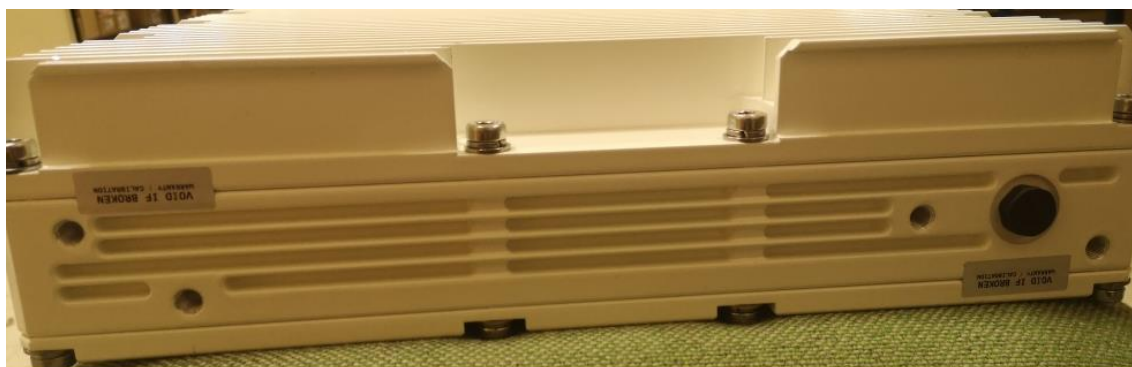
FIGURE 6 RRH B48 – LATERAL SIDE 2