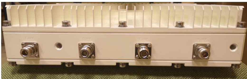
FIGURE 4 RRH B48 – DOWN SIDE