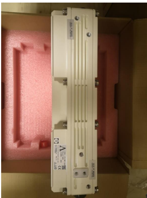
FIGURE 5 RRH B48 – LATERAL SIDE 1