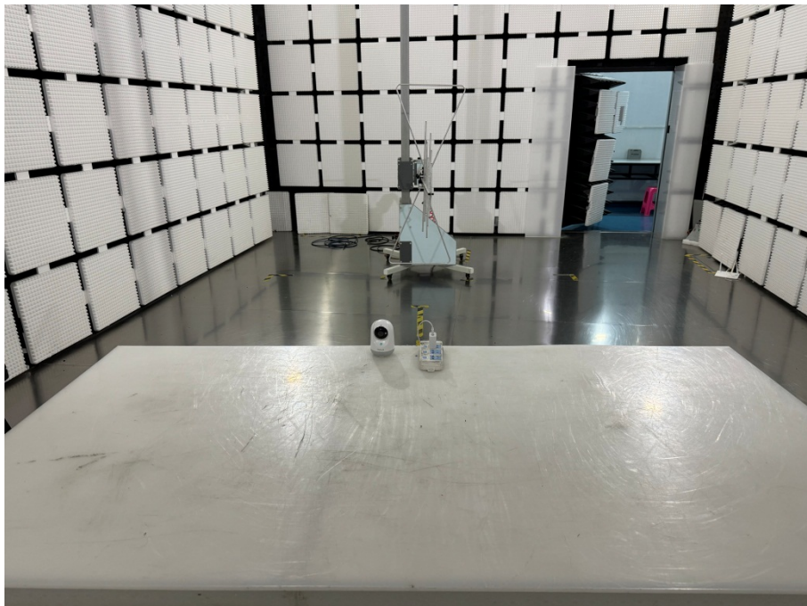
30MHz - 1GHz