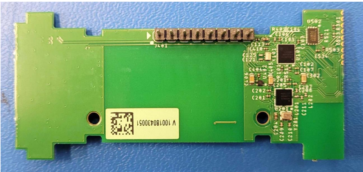
LVB bottom view