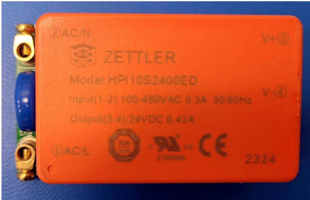
HVB top view