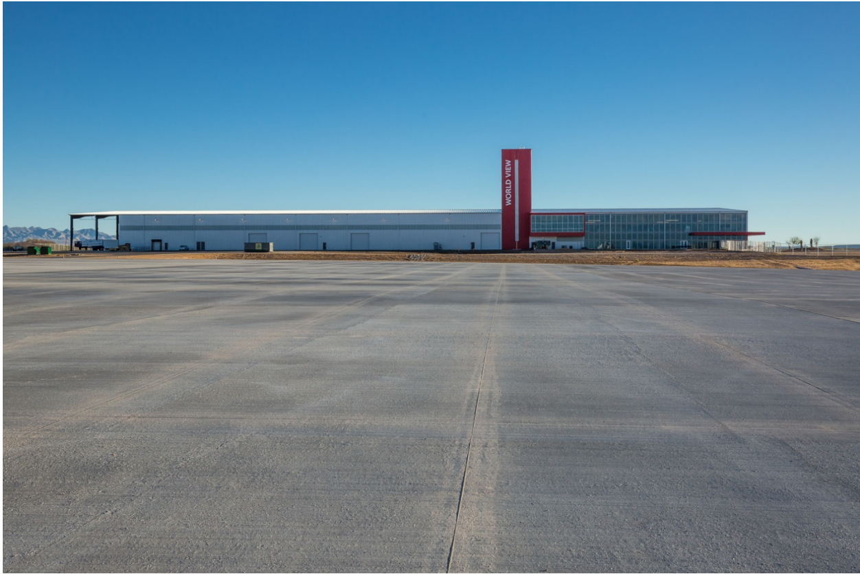
Figure 2. Spaceport Tucson & World View's Facility

Site 3 – Mobile Operations: This is the operational phase of the project. All operations will be mobile. The balloon will launch from Benson, Arizona. World View has some control over the trajectory of the balloon in flight, and it can assure operations within a limited radius. All operations will be conducted in US airspace. To maximize the effectiveness of the limited launch window, World View is seeking a 200 mile radius of operations (See Figure 3 below) in which to operate. This will allow for sufficient flexibility during transmission activities. This will also ensure that the flight provides the successful telemetry that has prompted World View's customer to seek this solution.