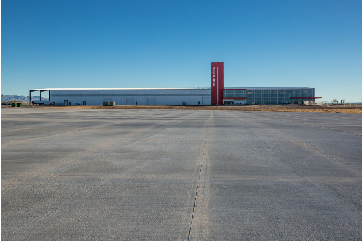
Figure 2. Spaceport Tucson & World View's Facility

Site 3 – Mobile Operations: This is the operational phase of the project. All operations will be mobile. The balloon will launch from Benson, Arizona. World View has some control over the trajectory of the balloon in flight, and it can assure operations within a limited radius. All operations will be conducted in US airspace. To maximize the effectiveness of the limited launch window, World View is seeking a 200 mile radius of operations (See Figure 3 below) in which to operate. This will allow for sufficient flexibility during transmission activities. This will also ensure that the flight provides the successful telemetry that has prompted World View's customer to seek this solution.