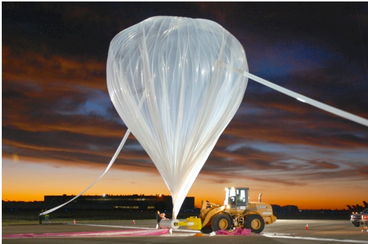
Figure 1. World View Stratospheric Balloon

In the past 14 days, World View has been working with KFC to put together a stratospheric balloon launch to take the Zinger to the edge of space. See Figure 1 below for an image of World View's stratospheric balloons. World View has been selecting technology, working to integrate the concept of operations into the World View platform, and planning for a successful mission on time, in June 2017. This is a short timeframe, but it is required by World View's customer.