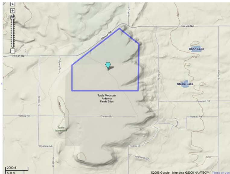
Figure 1: Experimental License operation area at Table Mountain.

The experiments will take place at the NTIA Table Mountain Radio Quiet Zone near Boulder Colorado operating under a Cooperative Research And Development Agreement (CRADA). The facility and area of operation are shown in Figure 1.