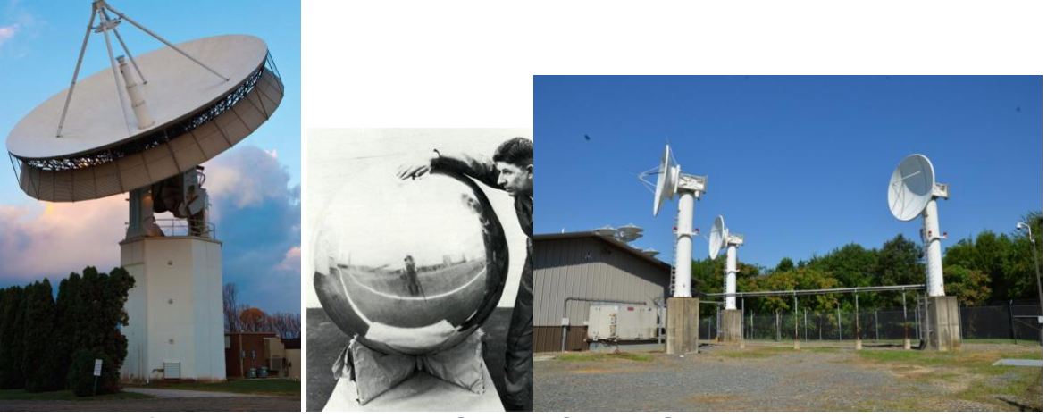
Figure 3 Left is the APL 18.3 Meter S-Band Ground Station Located in Laurel, MD Center: 1m Aluminum Sphere in low Earth Orbit Right: Three receive only antennas located on Stafford, VA