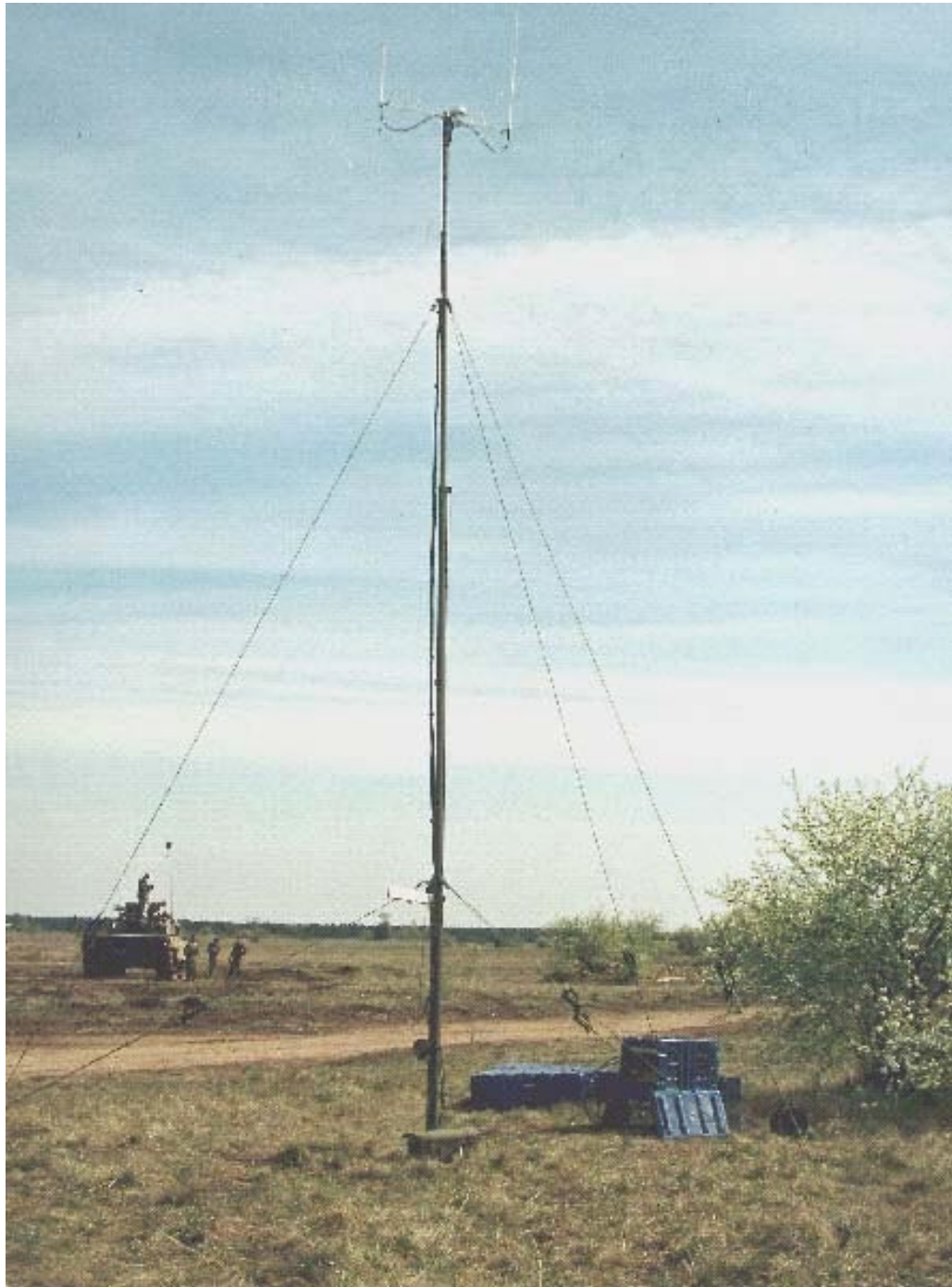
GAMER Portable Base Station with 10 meters antenna mast.