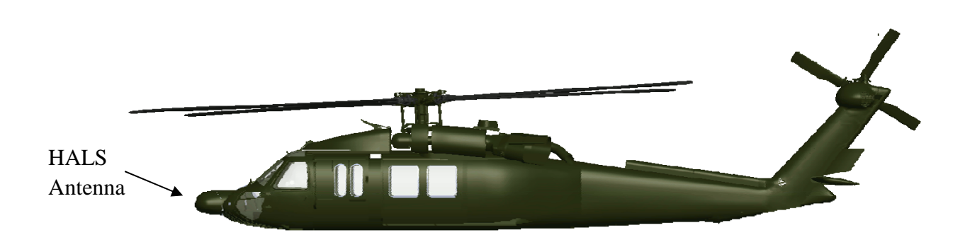
Exhibit A: Antenna Sketch