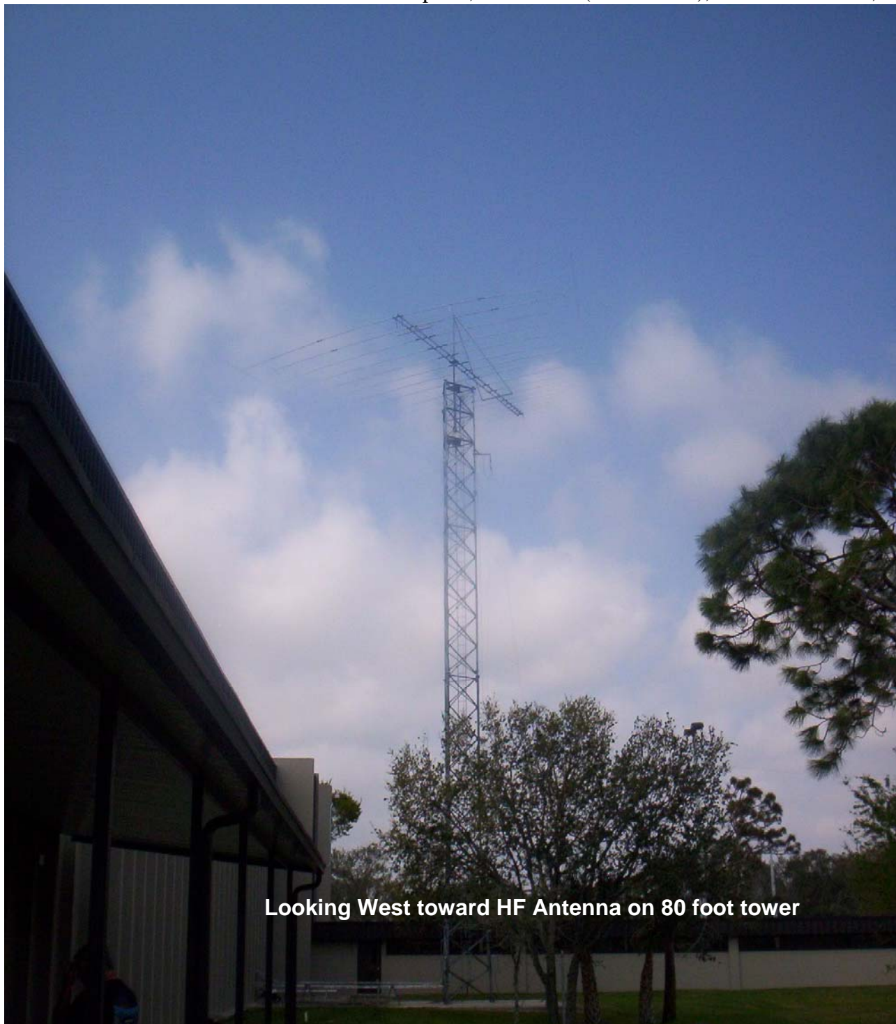
Looking West toward HF Antenna on 80 foot tower