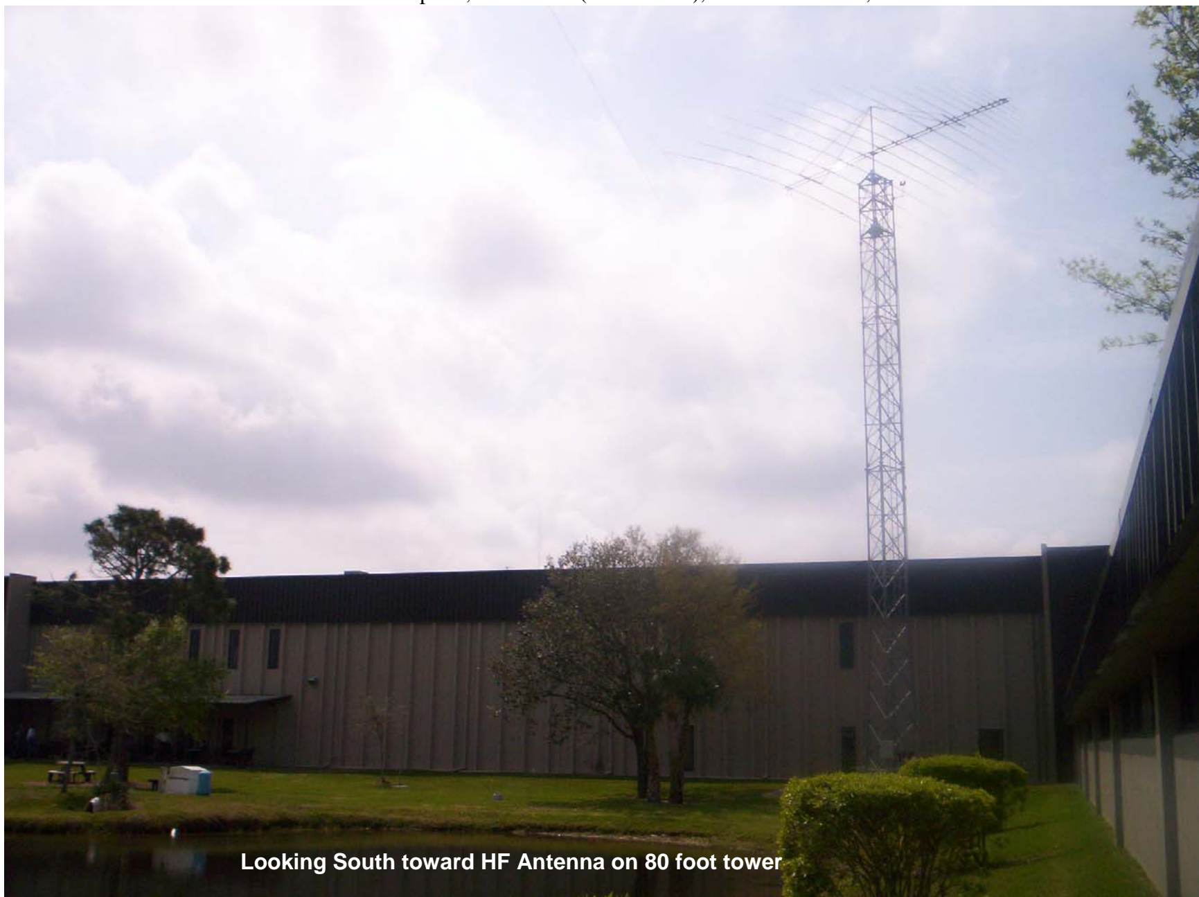
Looking South toward HF Antenna on 80 foot tower