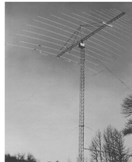
US Antenna Products LP-1017 Log Periodic Dipole Array 8 dBi @ 6.2 MHz 12 dBi @ 30 MHz Phase Center at 82 feet

CPL-920D antenna coupler provides the matching as required between the antenna and the transmitter. Transmitter output power = 125W = +20.969 dBW System average ERP at 6.2 MHz +20.969 - 0.213 + 8 = +28.756 dBW = 751 W ERP System average ERP at 30 MHz +20.969 - 0.442 + 12 = +32.527 dBW = 1,790 W ERP