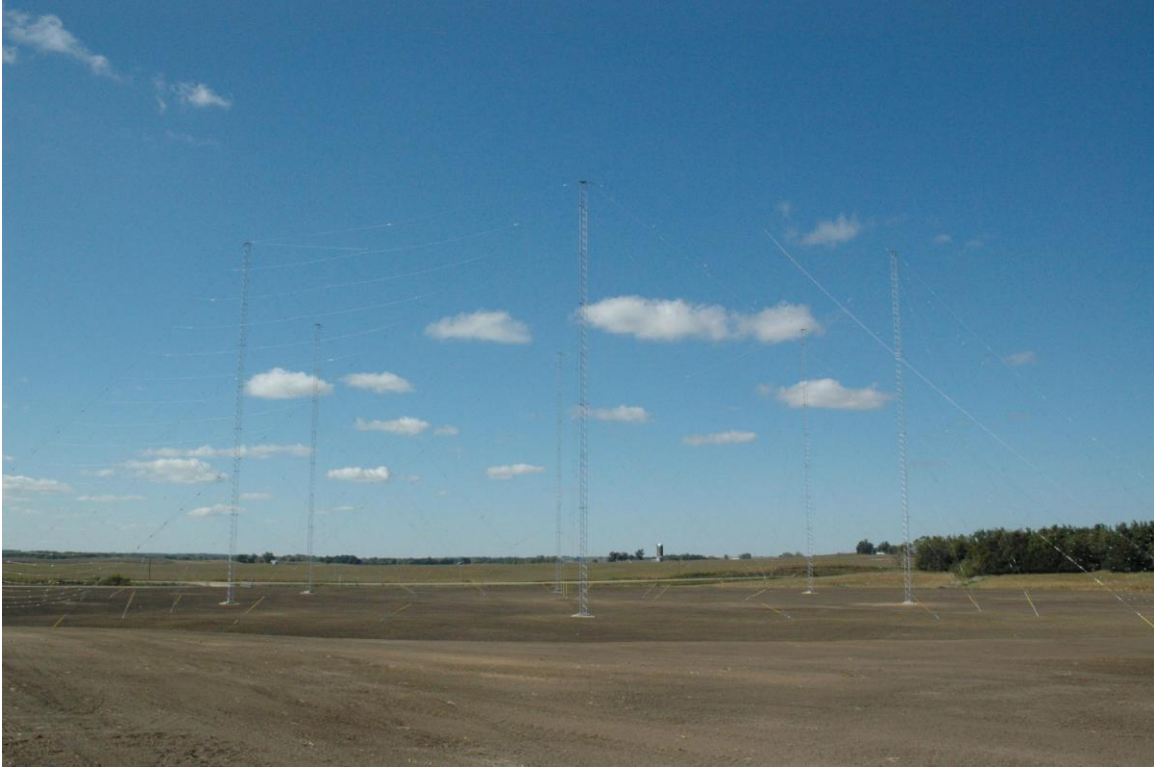
Oxford Junction, IA: RLP1