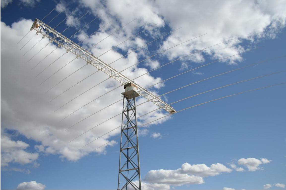
Las Cruces, NM: Inverted V antenna