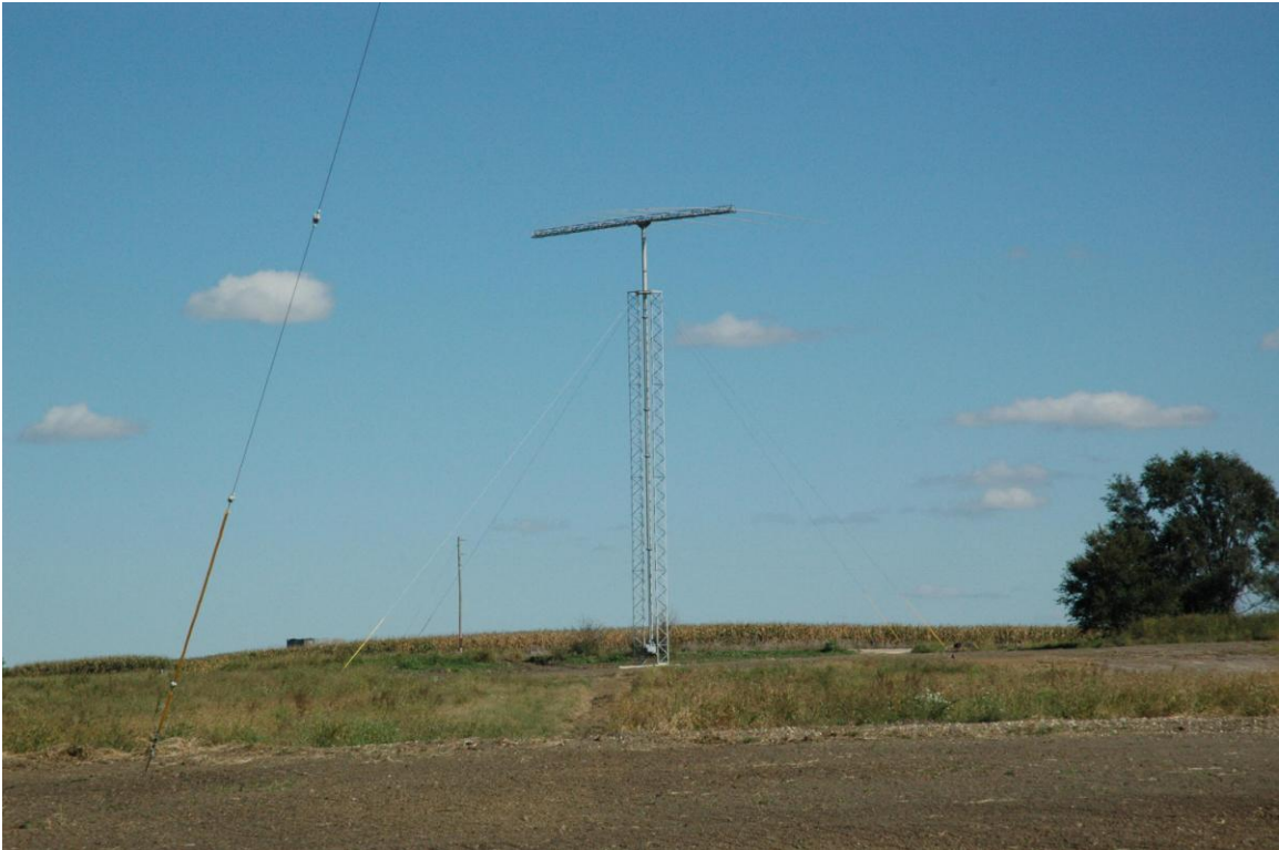
Oxford Junction, IA: Monopole (closest antenna)