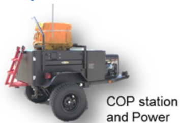
COP station and Power

COTS Command & Control & Data (2.4, 5.2, 5.8 GHz)