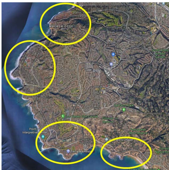
Figure 5: Potential areas for Mobile SIL Operation