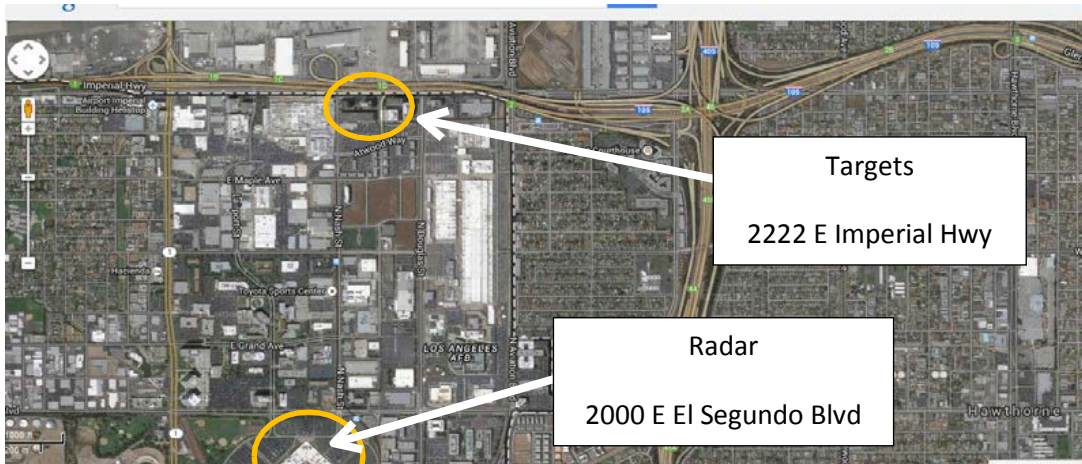
Figure 2 Location of the Radar and Targets

The ViSAR system will also image some of the terrain located within the confines of the Raytheon facility as shown on figure 3.