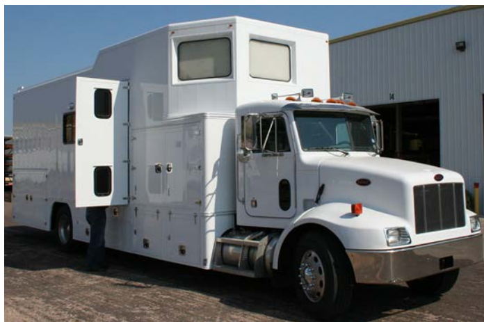
Figure 4: Raytheon Mobile SIL

Dynamic ground testing will be performed in Palos Verdes, CA utilizing the Raytheon Mobile SIL. A photo of the Raytheon Mobile SIL is shown in Figure 4. The Mobile SIL will operate on shore power and generator power with the gimbal and rack mounted electronics equipment installed inside. The Mobile SIL will be used to collect dynamic navigation data and radiate to collect radar data. The candidate roads for useful data collections are elevated and provide an unobstructed view of image areas at a depression angle in the tens of degrees to steeper at stand off ranges of 1-3 km. The potential regions for testing the ViSAR in the Mobile SIL are shown in Figure 5.