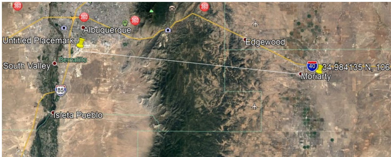
Figure 3. Mountains between Moriarty Airport and Albuquerque SunPort

Natural terrain features will prevent the signal from propagating very far from the area of operations, because of building attenuation, the downward directionality of the antenna, and natural features such as the Sandia Mountains, which have an average elevation over 7,000 feet. The Sandia Mountains will protect Albuquerque Sunport, New Mexico's largest commercial airport, which is about 35 miles away.