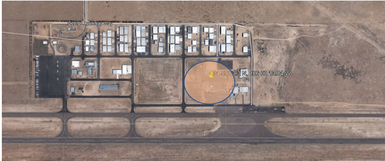
Figure 2. Moriarty Airport – area of operations is circled, radius of about 300 ft.

The area is less than 1 km in diameter. Below is an aerial view of the area of operations.