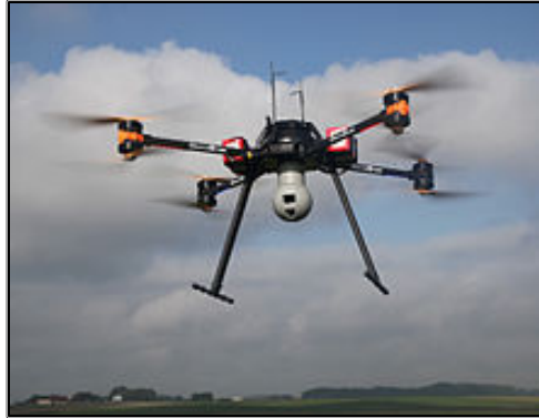
Figure 1. Quadcopter with testing technology mounted underneath

The radar system will have its directional antenna oriented down. The image below is a generic version of the proposed testing vehicle.