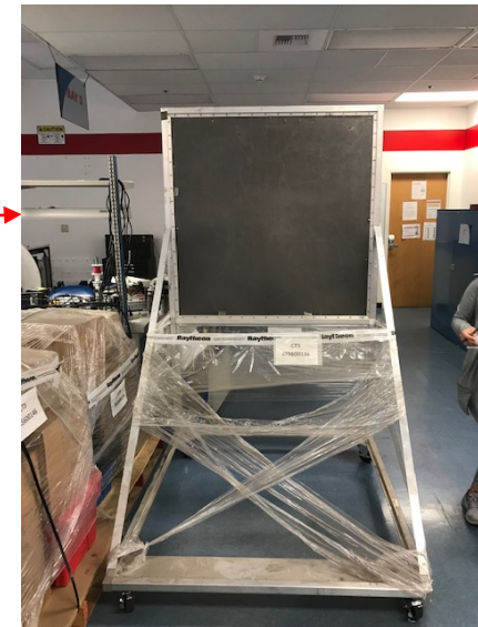
Target Absorber panel