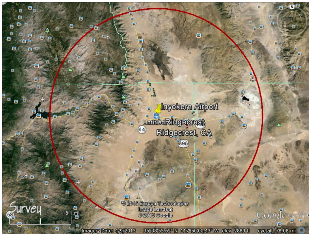
Figure 1. Ridgecrest, California Test Area

Ridgecrest, California: The testing at Ridgecrest, California was requested by Raytheon’s Navy customers. They are interested in exploring how the radar seeker will be able to work addressing some specific threats that the Navy needs to neutralize.