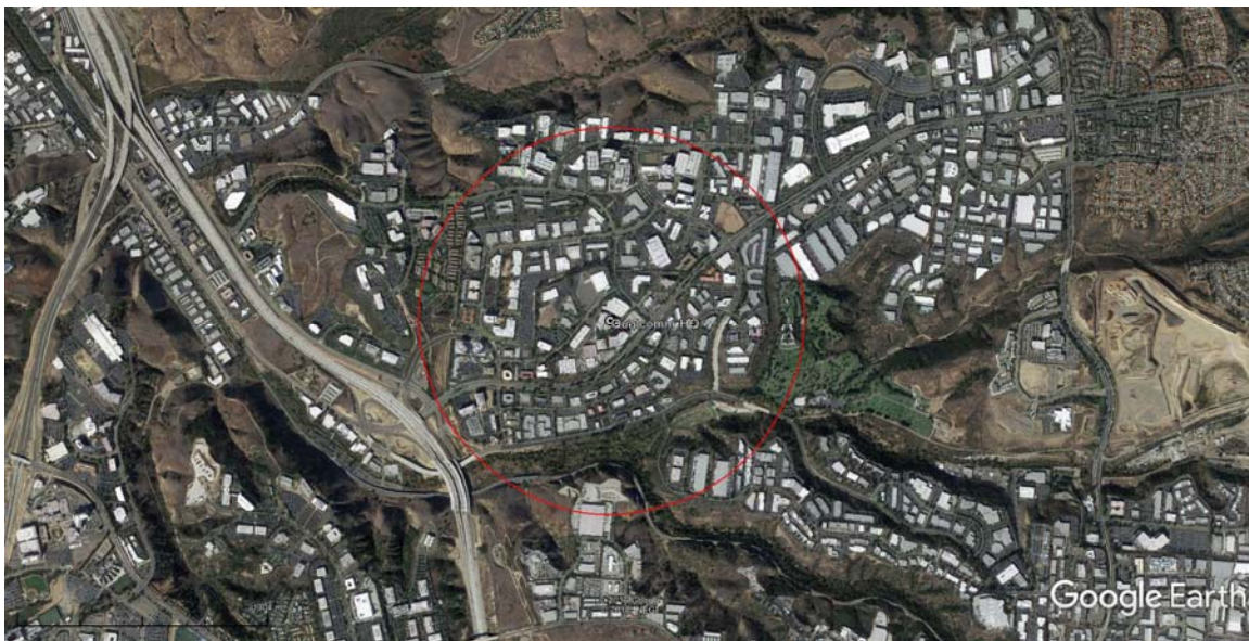
Figure 1. Sorrento Valley, San Diego, CA region of operation.

Up to 4 base-stations and 3 associated mobile devices per base-station may operate within the highlighted contours at any time.