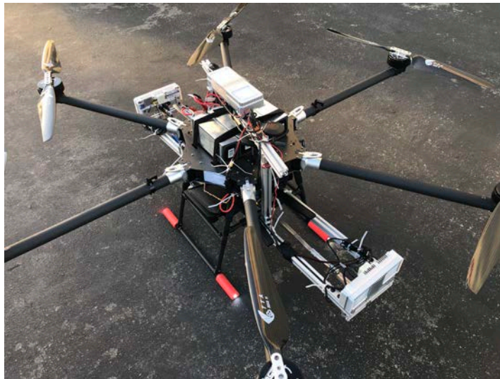
Figure 2. Three radar units mounted on a drone for testing.

In order to test them, we would like to mount a few of them on a drone as shown in Figure 2. The total weight of the drone assembly is < 65lbs.